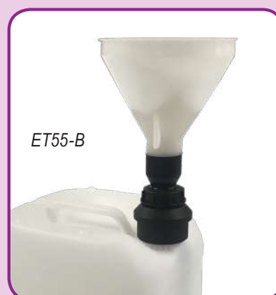
Funnel with ball valve without activated charcoal cartridge