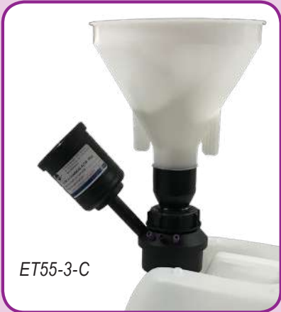
Funnels with ball valve with activated charcoal cartridge