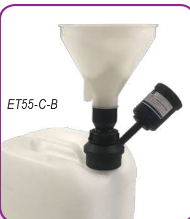
Funnel with ball valve with activated charcoal cartridge